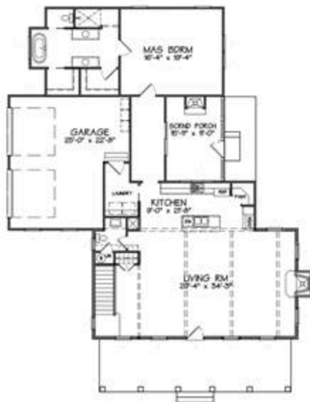
LOWER LEVEL FLOOR PLAN